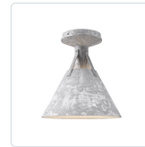
FM584811SL Steel Shade

*For complete warranty terms, please visit: www.aloralighting.com/warranty